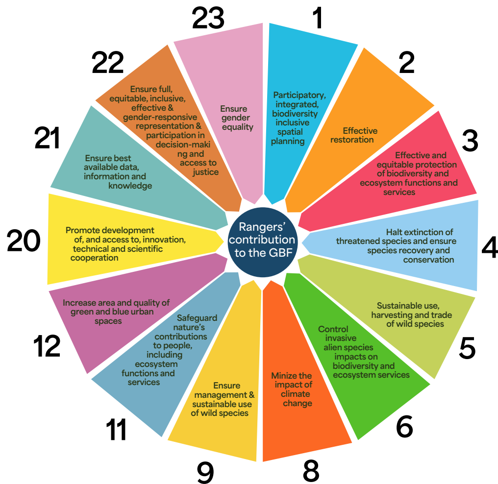
Figure 1. The contributions of rangers to the targets of the Global Biodiversity Framework (Stolton et al 2023).

In 2022, the International Ranger Federation (IRF), the Universal Ranger Support Alliance (URSA) and other partners issued a policy note calling for the Global Biodiversity Framework to recognise rangers as 'essential planetary health workers' 1 .